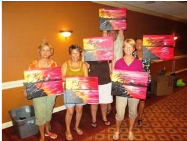
Wine and Canvas