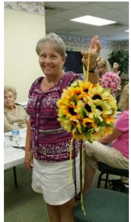
Monthly Craft “Kissing ball”