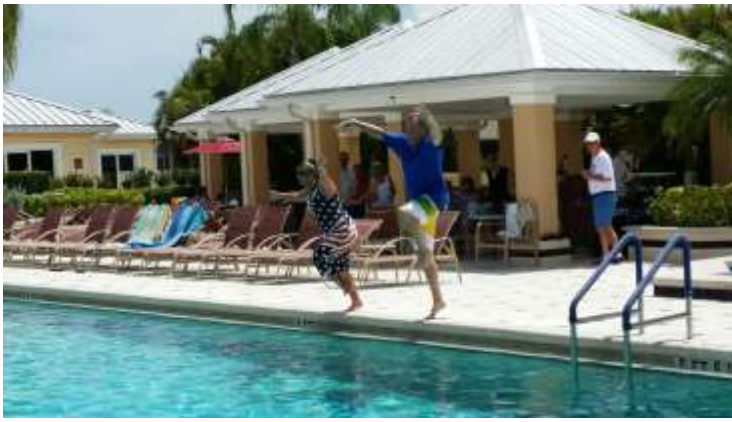
July 4th celebration